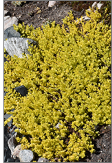
Goldilocks Creeping Jenny

Goldilocks Creeping Jenny is a fine choice for the garden, but it is also a good selection for planting in outdoor containers and hanging baskets. Because of its spreading habit of growth, it is ideally suited for use as a 'spiller' in the 'spiller-thriller-filler' container combination; plant it near the edges where it can spill gracefully over the pot. Note that when growing plants in outdoor containers and baskets, they may require more frequent waterings than they would in the yard or garden.