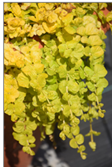
Goldilocks Creeping Jenny foliage

Goldilocks Creeping Jenny is recommended for the following landscape applications;