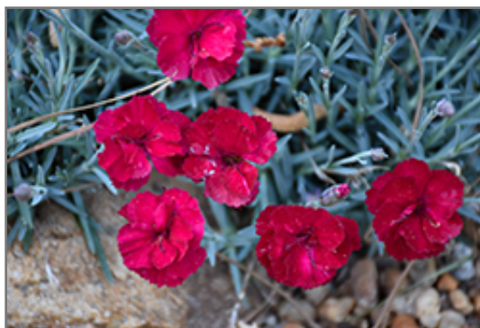
Frosty Fire Pinks flowers