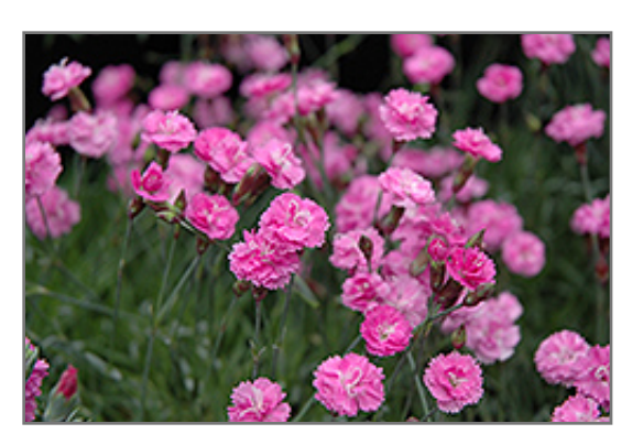
Tiny Rubies Dwarf Mat Pinks flowers

Tiny Rubies Dwarf Mat Pinks is recommended for the following landscape applications;