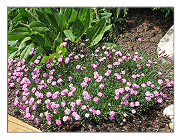
Tiny Rubies Dwarf Mat Pinks in bloom

5301 E. Terra Cotta Ave. Crystal Lake, IL. 60014 countrysideflowershop.com