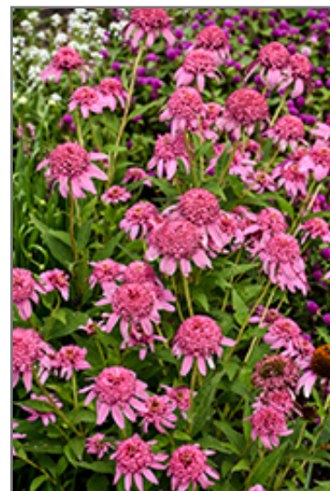
Cone-fections Pink Double Delight Coneflower flowers