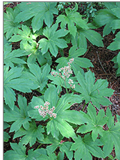
Crimson Fans Mukdenia flowers

Crimson Fans Mukdenia is a fine choice for the garden, but it is also a good selection for planting in outdoor pots and containers. It is often used as a 'filler' in the 'spiller-thriller-filler' container combination, providing a mass of flowers and foliage against which the larger thriller plants stand out. Note that when growing plants in outdoor containers and baskets, they may require more frequent waterings than they would in the yard or garden.