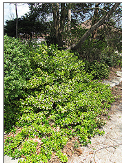
Emerald 'n' Gold Wintercreeper