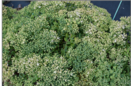
Thundercloud Stonecrop flower buds

Thundercloud Stonecrop is a fine choice for the garden, but it is also a good selection for planting in outdoor pots and containers. It is often used as a 'filler' in the 'spiller-thriller-filler' container combination, providing a mass of flowers and foliage against which the thriller plants stand out. Note that when growing plants in outdoor containers and baskets, they may require more frequent waterings than they would in the yard or garden.