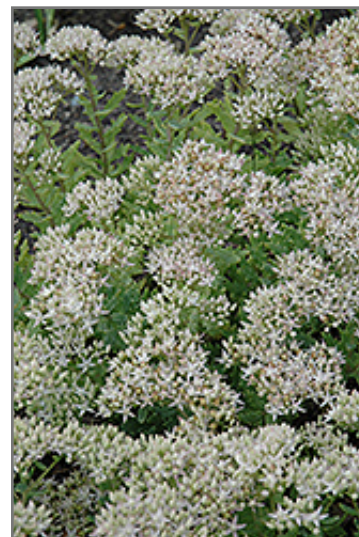
Thundercloud Stonecrop flowers

Thundercloud Stonecrop is recommended for the following landscape applications;